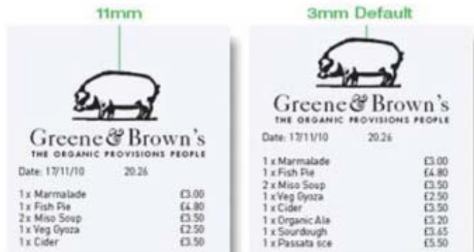
Difference between an 11 mm and 3 mm top margin

Retailers automatically save simply by using an eco printer that comes with a standard 3 mm Top Margin.